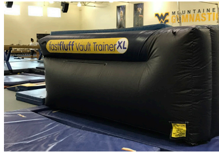
West Virginia University

We understand this and can make your Fast Fluff™ Vault & Floor Trainer, using your colors and logo, in any combination you need.