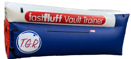
The Gymnastics Revolution