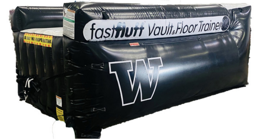
University of Washington