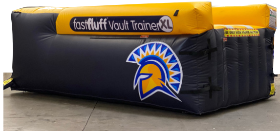
San Jose State University