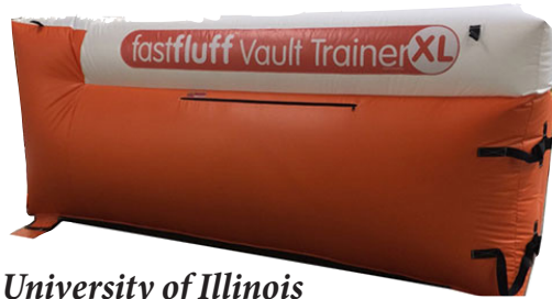
University of Illinois